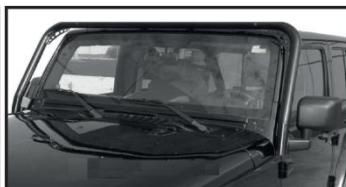
JEEP® LIGHT BARS